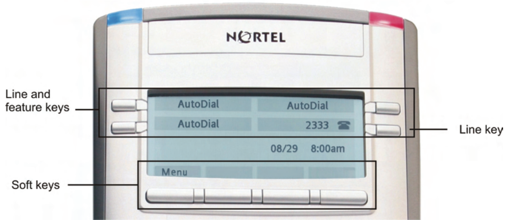
Figure 2: Display area features