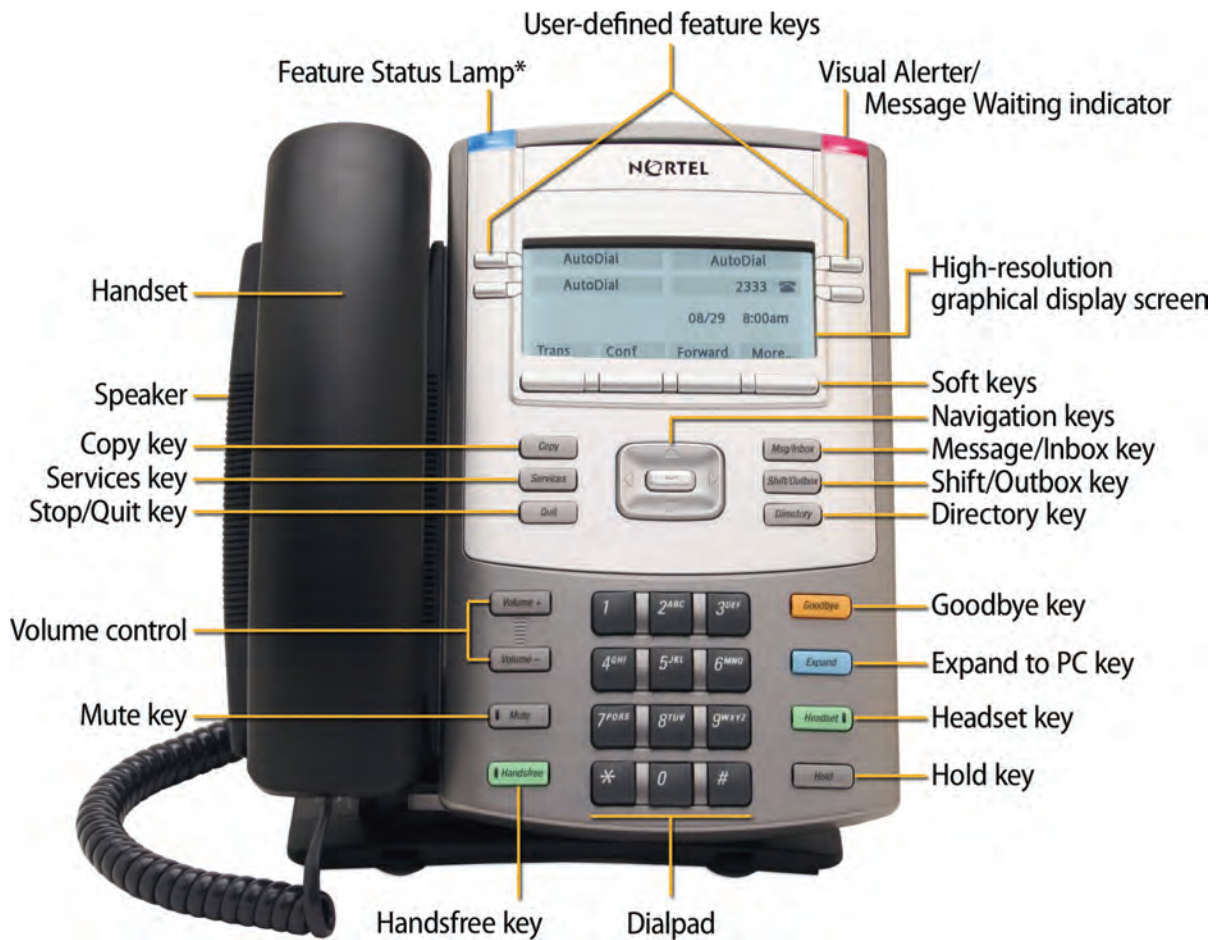
Figure 1: Physical features